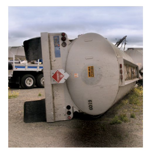
ProRAE Guardian helps incident command establish a perimeter, track and identify the real-time concentration of toxic chemicals, combustible materials, radiation, and plumes to protect responders and the community.