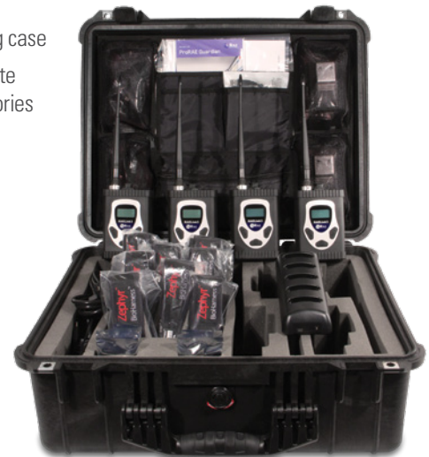
BioHarness Team Kit

BioHarness is a trademark of Zephyr Technology