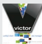
victor Unified Client