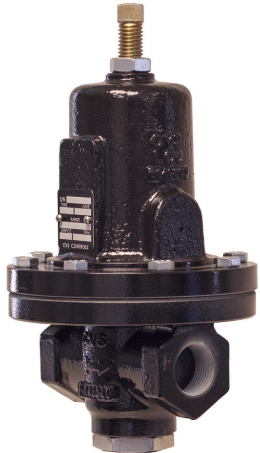
CVS Series 95H Regulator

Body materials available are cast iron, steel and stainless steel. Body sizes available are 3/4" and 1" NPT with 9/16" orifice.