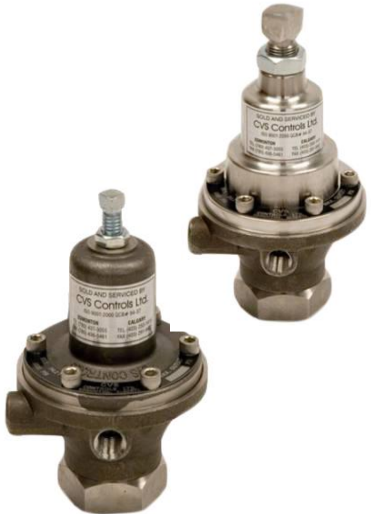
Figure 1: CVS Type 1301F and CVS Type 1301G Regulator

The CVS Type 1301F is available in three spring ranges to provide outlet pressures to 225 psig (15.5 bar). CVS Type 1301G provides outlet pressures to 500 psig (34.5 bar) in one spring range. Inlet pressures can range up to 6000 psig (411 bar).