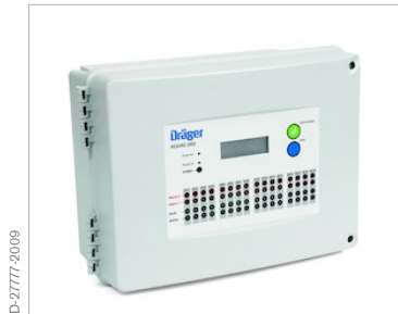
Dräger REGARD® 3900