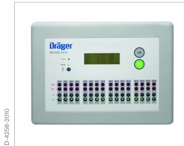
Dräger REGARD® 3910