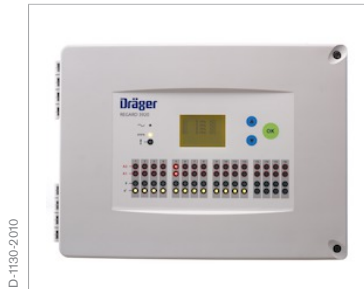
Dräger REGARD® 3920