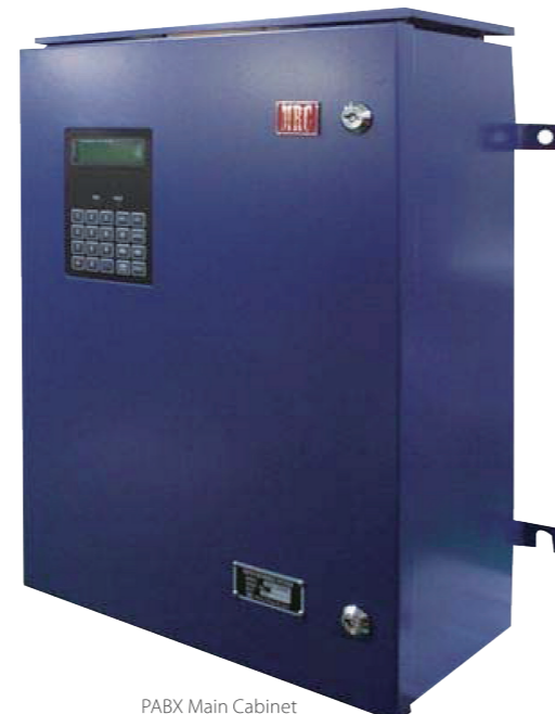
PABX Main Cabinet