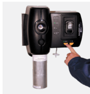
Bump testing ToxiRAE 3 with AutoRAE Lite Bump Test and Calibration Station