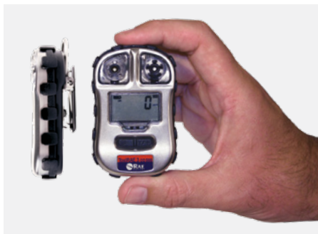
Convenient small size