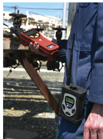
UltraRAE 3000 with RAELink3 used for screening potentially hazardous leaks