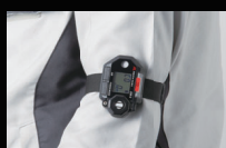
Worn on arm (band type) * Attached to arm band