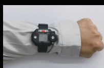
Attached to wrist (wristwatch type) *Attached to watch band