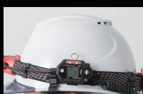
Mounted to helmet band * Attached to belt clip