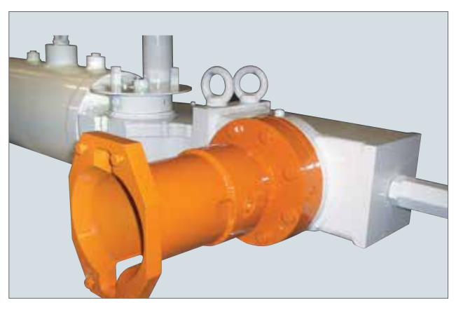
ISO 13628-8 Class 4 ROV receptacle for rotary torque tool operation of the actuator mechanical over-ride.