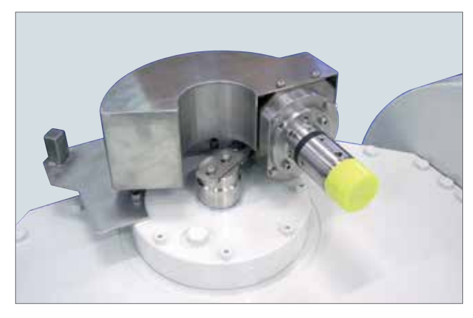
Position transducer assembly with electrical instrumentation connector.

For further information see publication F800 or visit the Rotork website www.rotork.com